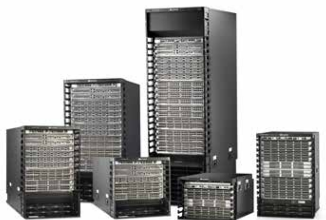
Figure 1 CE12800 series

The CE12800 series is available in six models: CE12816, CE12812, CE12808, CE12804, CE12808S, and CE12804S. They all use interchangeable modules to reduce costs of spare parts. This design ensures device scalability and provides investment protection.